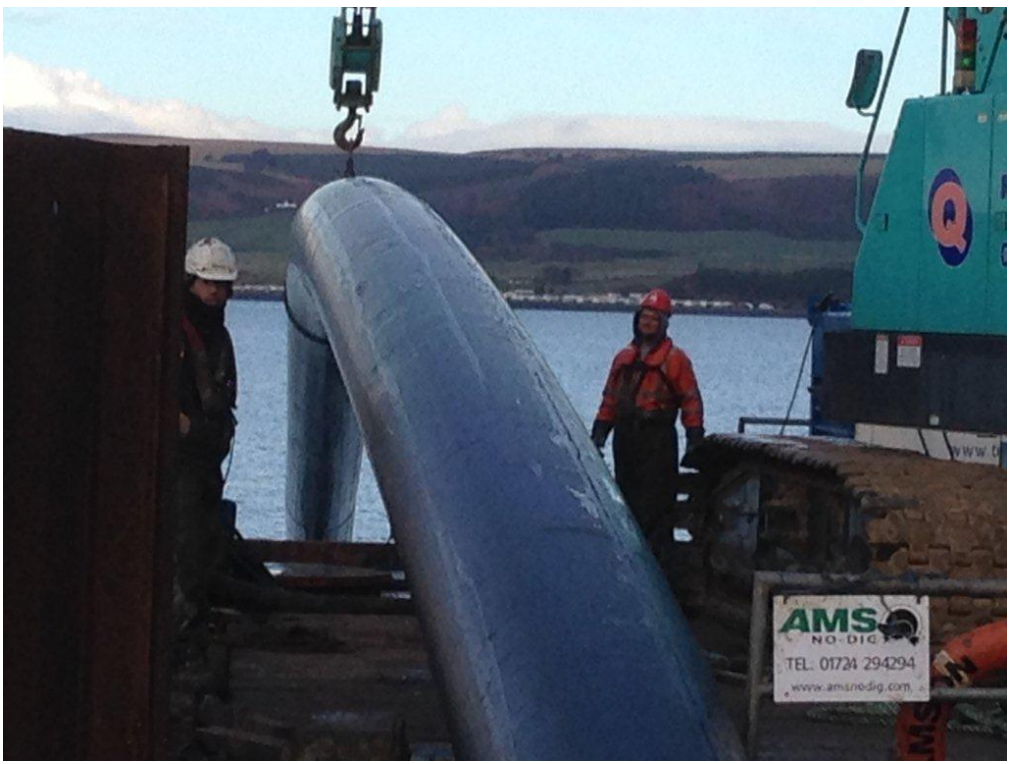
Pipeline positioned on the sea barge during installation

For more details please contact AMS No-Dig Ltd: