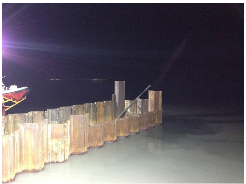
Pilot drill exiting the coffer dam